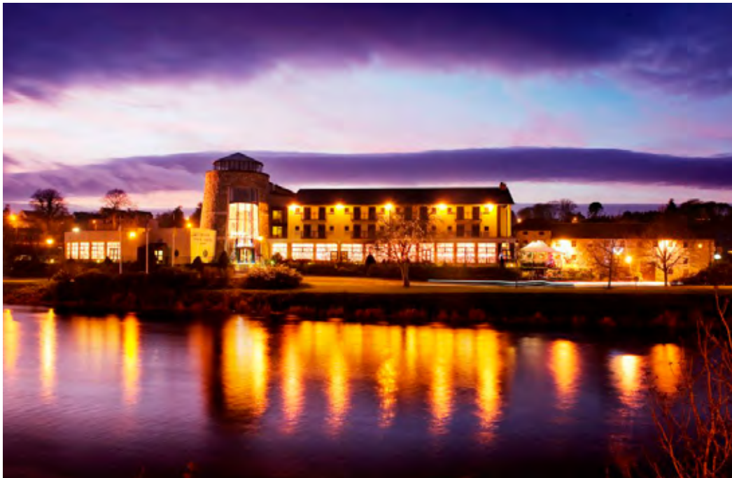
The Riverside Park Hotel located on the banks of the River Slaney.