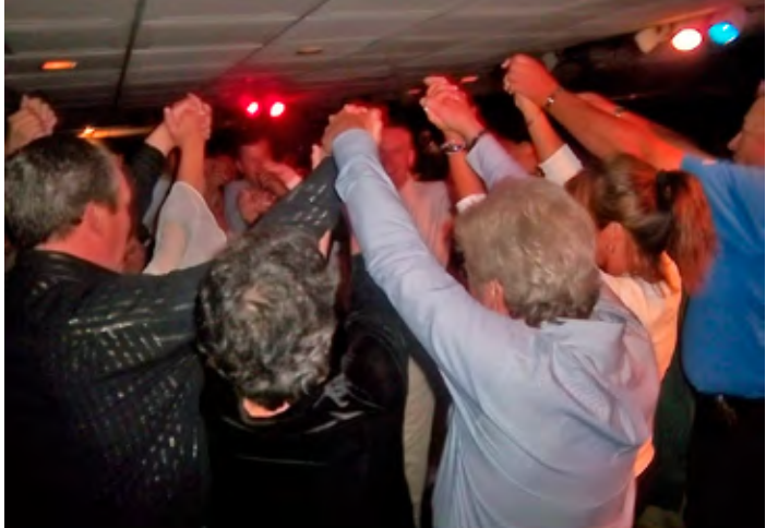
And to celebrate our organization by joining hands

There was a well-attended "Duck Tour;" a tour of Boston in a WWII-style amphibious landing vehicle and lots of laughs in the CII suite during evening hours. Rumor has it that hotel security was dispatched to sequester the noise emanating from our suite. We all know whose fault that was!