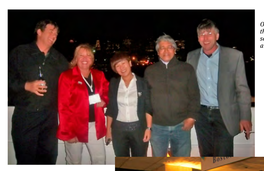
Others weathered the wind on the second floor...with a view of Boston