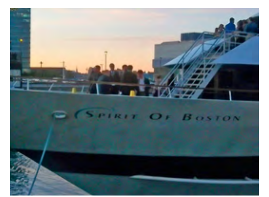
The Spirit of Boston cruise offered a beautiful view from the Harbour

night out on the Boston Harbor where CII colleagues set sail for fun filled evening. A tour on the Spirit lead many of CII members out on to the deck to see the stars and lights of Boston from the harbor. Even the wind did not keep us from venturing out there. We feasted on a delicious buffet and watched the youthful entertainment