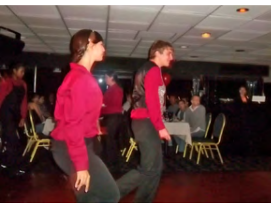
And CII members did dance!!!!!!

with fantastic voices that filled the room with energy. This of course led the CII dance team onto the floor where we twisted, moon-walked and jived. It brought back fond memories of our youth! We joined hands, danced and rocked the boat until we docked. What a great way to spend a Friday night.