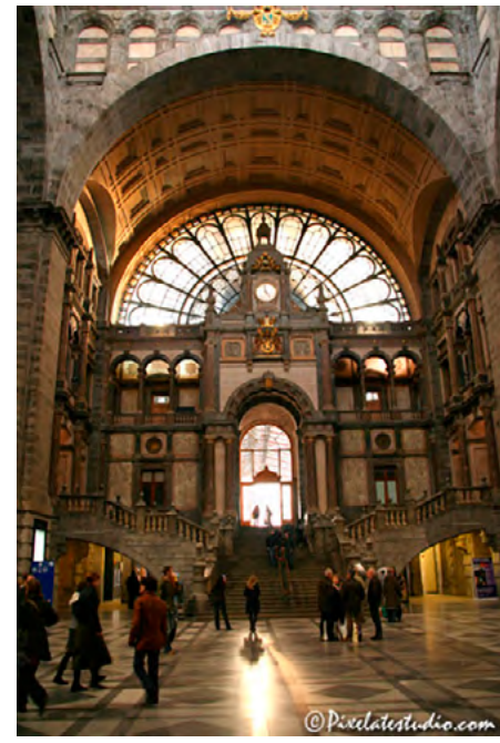
Central Station: Considered As One Of Most Beautiful In Europe.

The city was foreigner-controlled and very cosmopolitan, with merchants and traders from