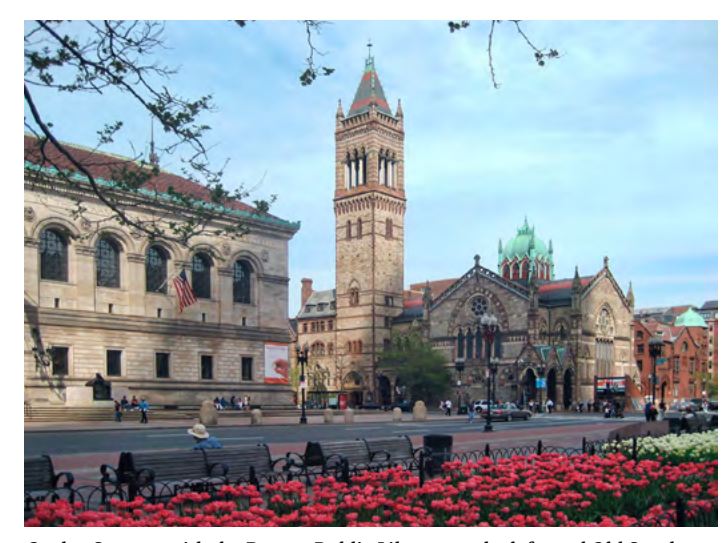
Copley Square, with the Boston Public Library on the left, and Old South Church on the right

professional sports organizations. Millions of people visit Boston annually to take in its historic neighborhoods, attend cultural and sporting events, and conduct business.