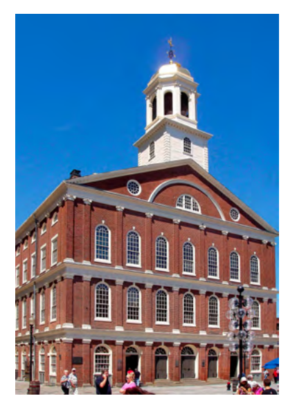
Faneuil Hall, a well-known stop on the Freedom Trail, sometimes called "the Cradle of Liberty" because of its role in the American Revolution

his year's AGM Technology Seminar will be held in Boston, Massachusetts, USA. Boston is a major economic/cultural hub and seaport located along the Northeast coast of the United States, in an area referred to as New England.