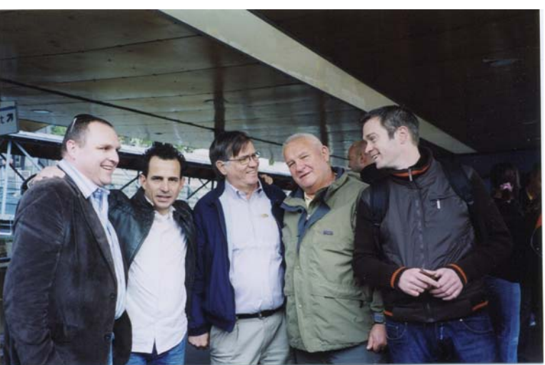
Fun in London!