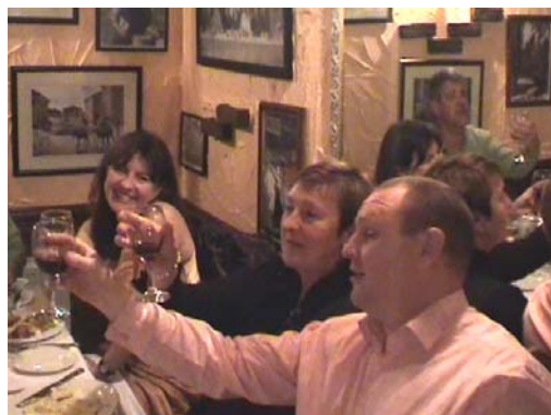
Your author responding to said toast along with a 'Podette'!

Well that about wraps this story up, please bear in mind that some