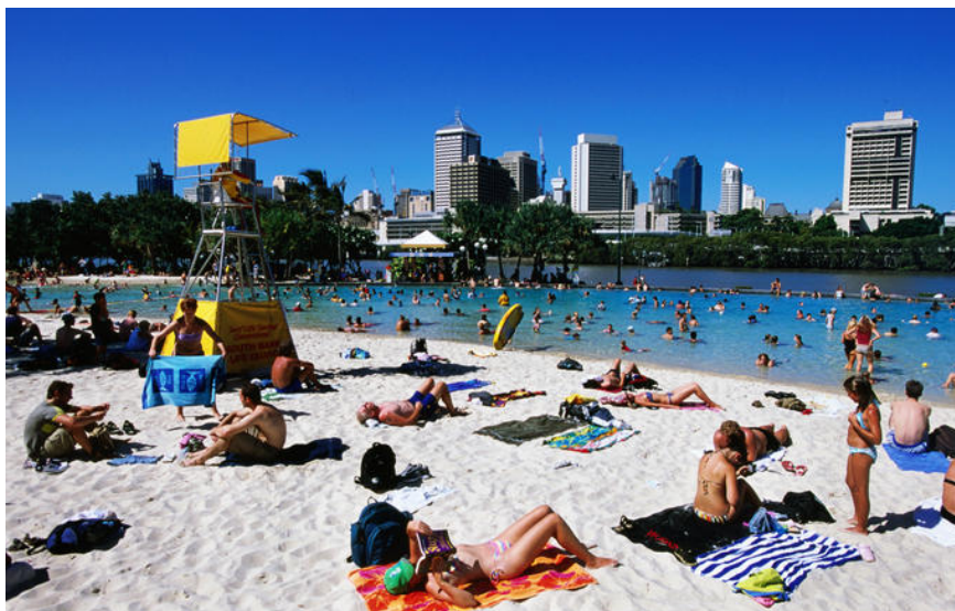
Pauls Breaka Beach, South Bank Parklands.