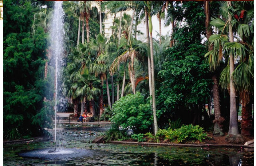
The Botanical Gardens