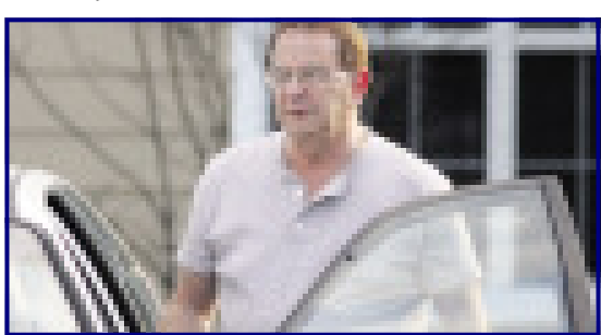
Looks like a surveillance photo to me!