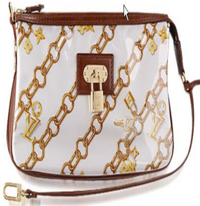
Louis Vuitton handbag from the Spring collection

The US Chamber cited other horror stories of brake pads made in China from compressed grass, that disintegrated into dust and exploding cell phone batteries that have resulted in serious burns. - Amalgamated stories from James Doran of the London Times and Halifax Herald