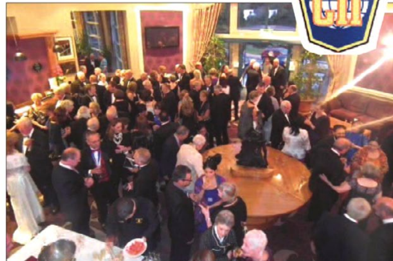
Mingling in the foyer at CII Conference.