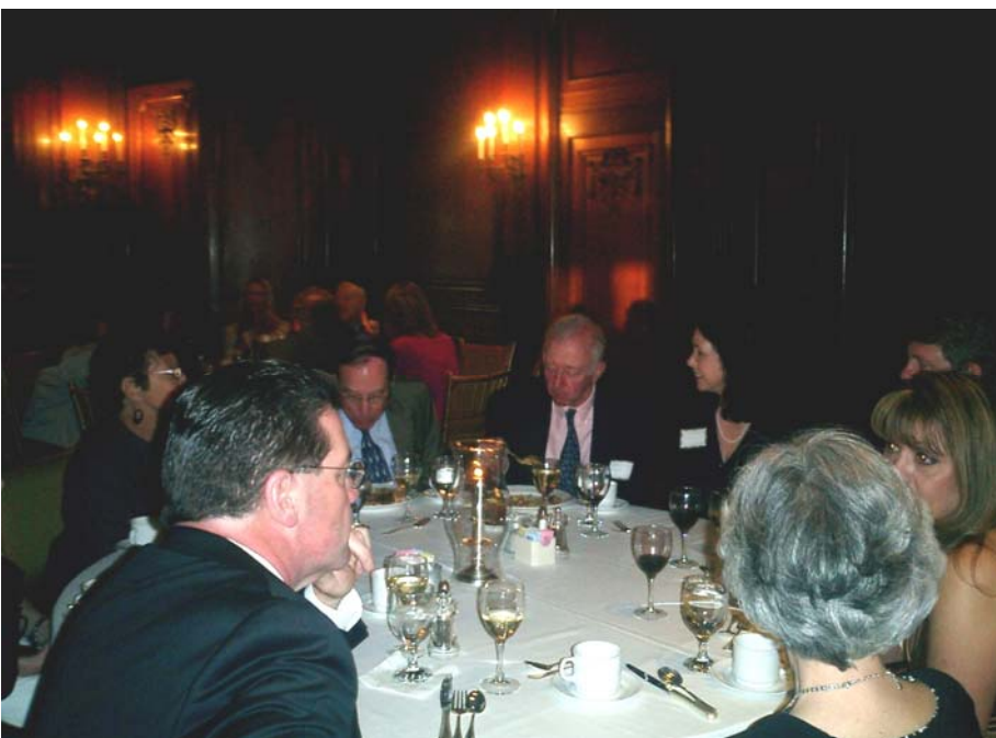
Some of the crowd at the DC CII Regional Meeting.